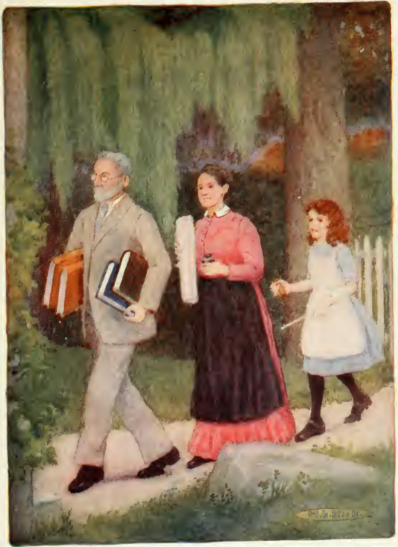
DORA MARCHED BEHIND WITH A WAX TAPER AND SOME CIGARS